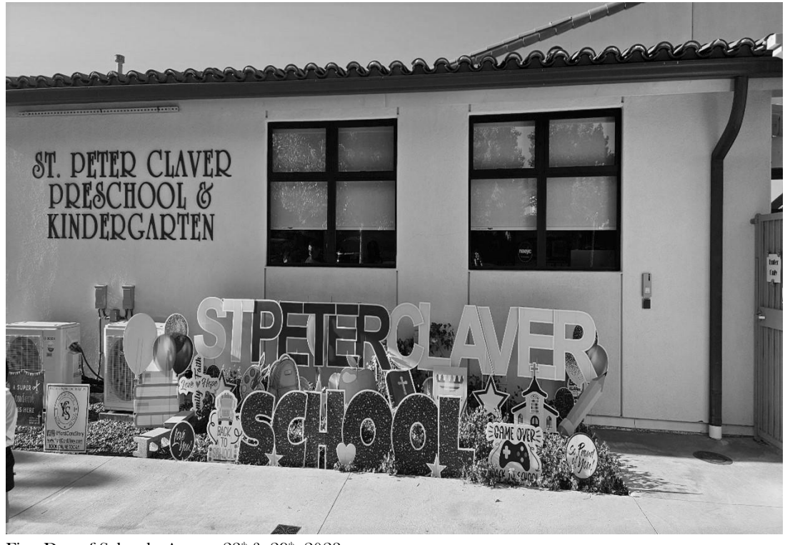
First Day of School - August 28th & 29th, 2023.

We are grateful you have chosen St. Peter Claver Preschool & Kindergarten for your child's educational needs. We are not only dedicated to providing your child with the best education possible, we want to be the vessels through which your child experiences the love of God.